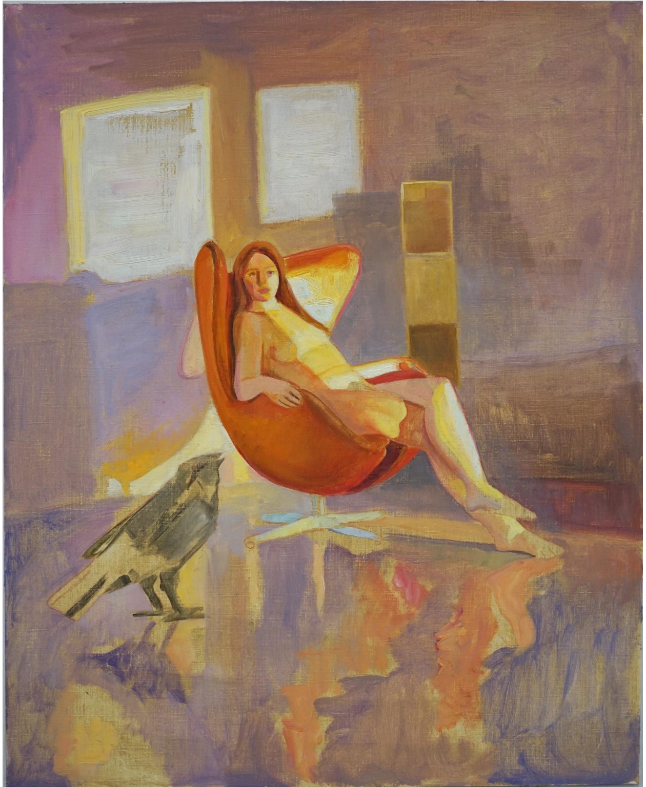
Raven Witch , 2021 | oil on canvas paper, 51x41 cm