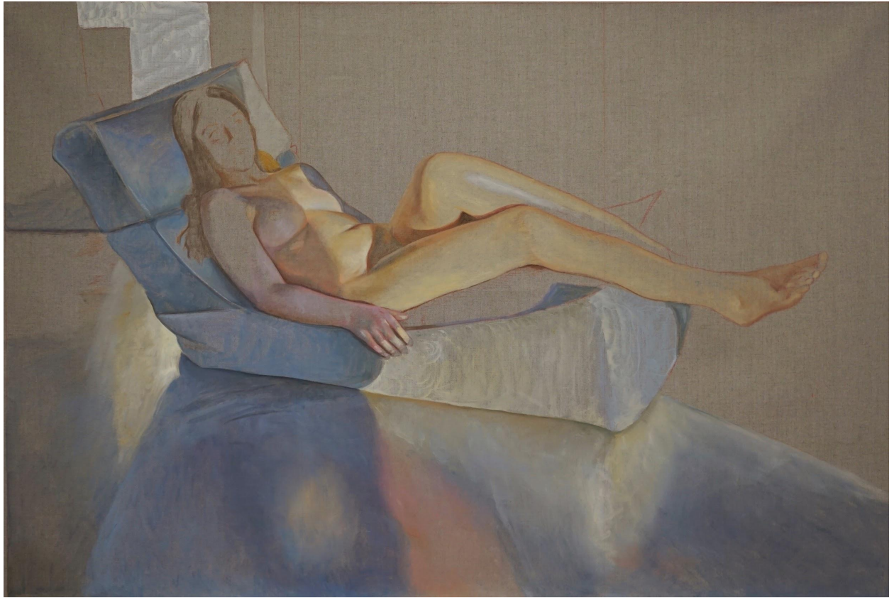
Mind Overshadowed , 2021 | oil on linen, 120x180 cm