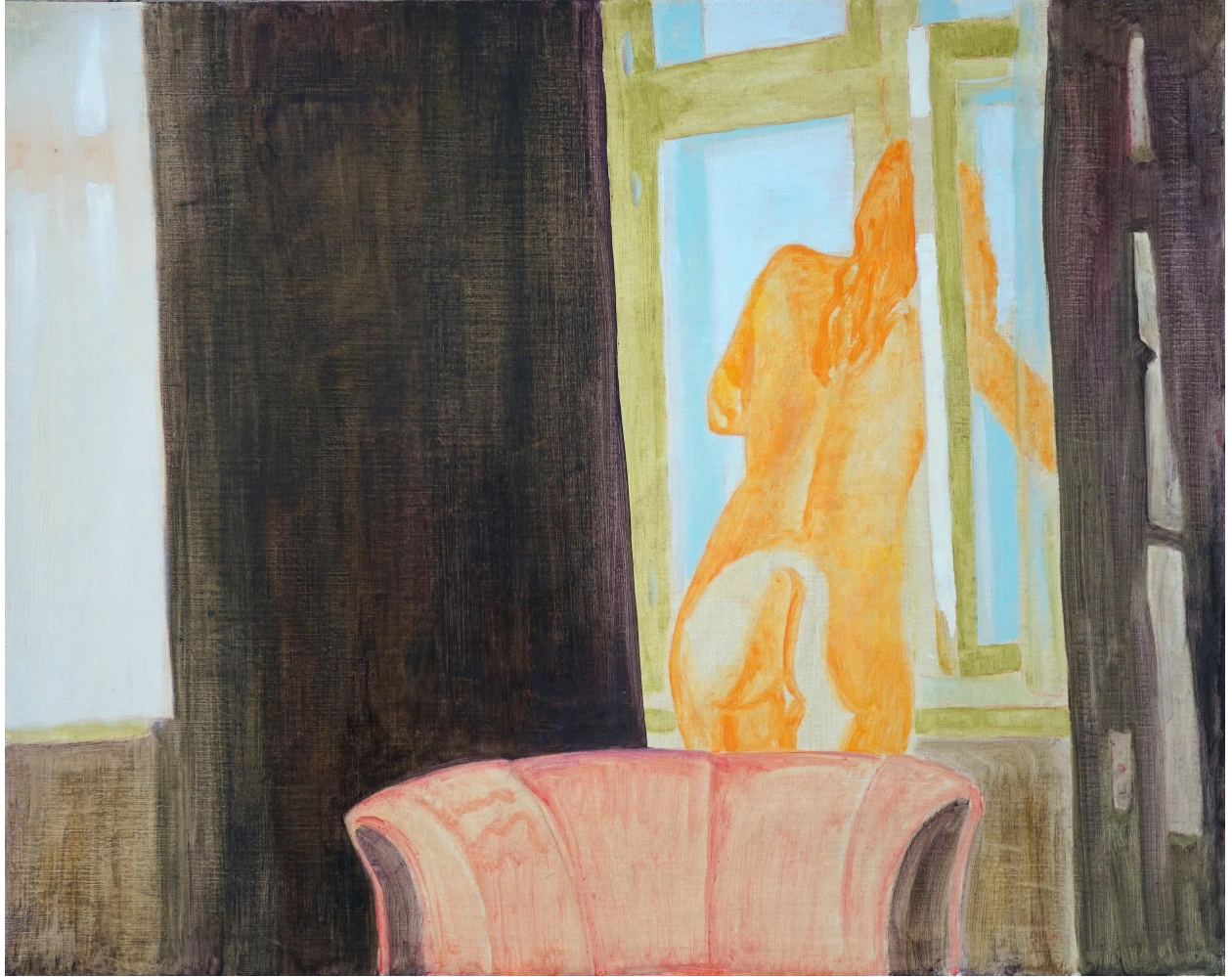
Borg Window 2 , 2021 | oil on canvas paper, 41x51 cm