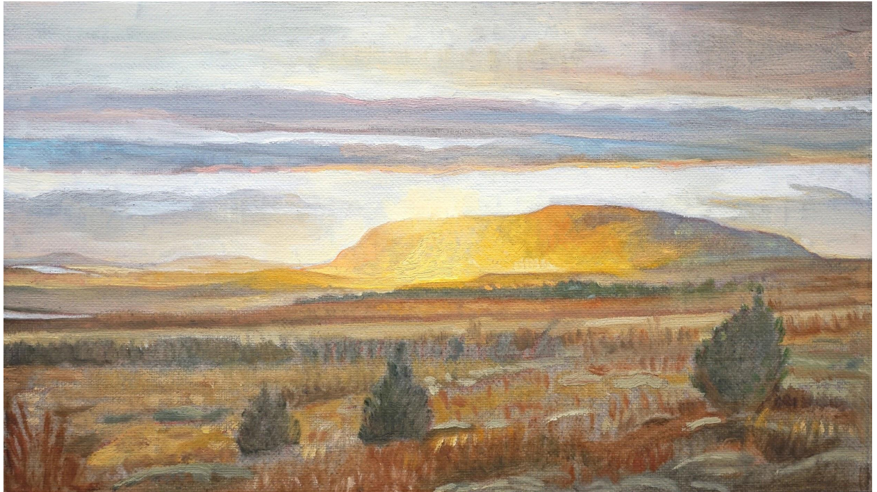
Vörðufell-Golden , 2021 | oilonlinen, 20 x 36 cm