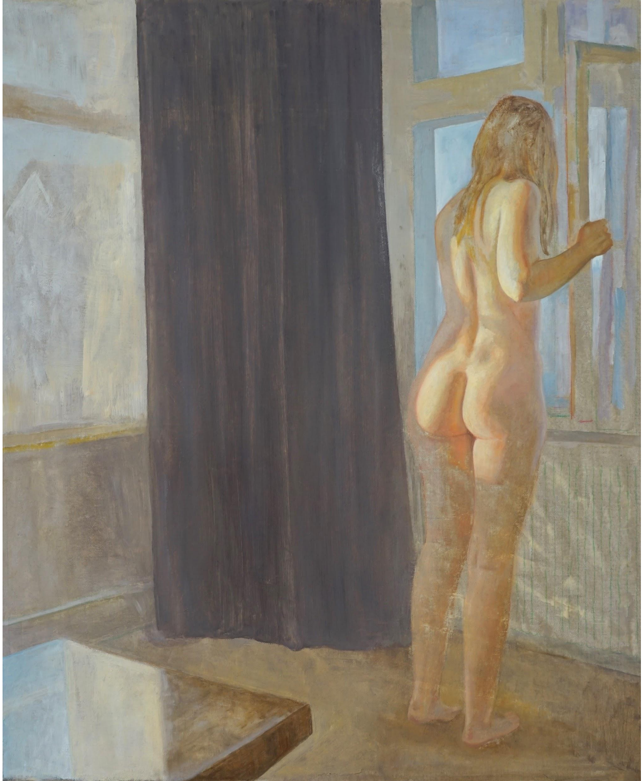
Doors of Respiration , 2021 | oil on linen, 92x77 cm