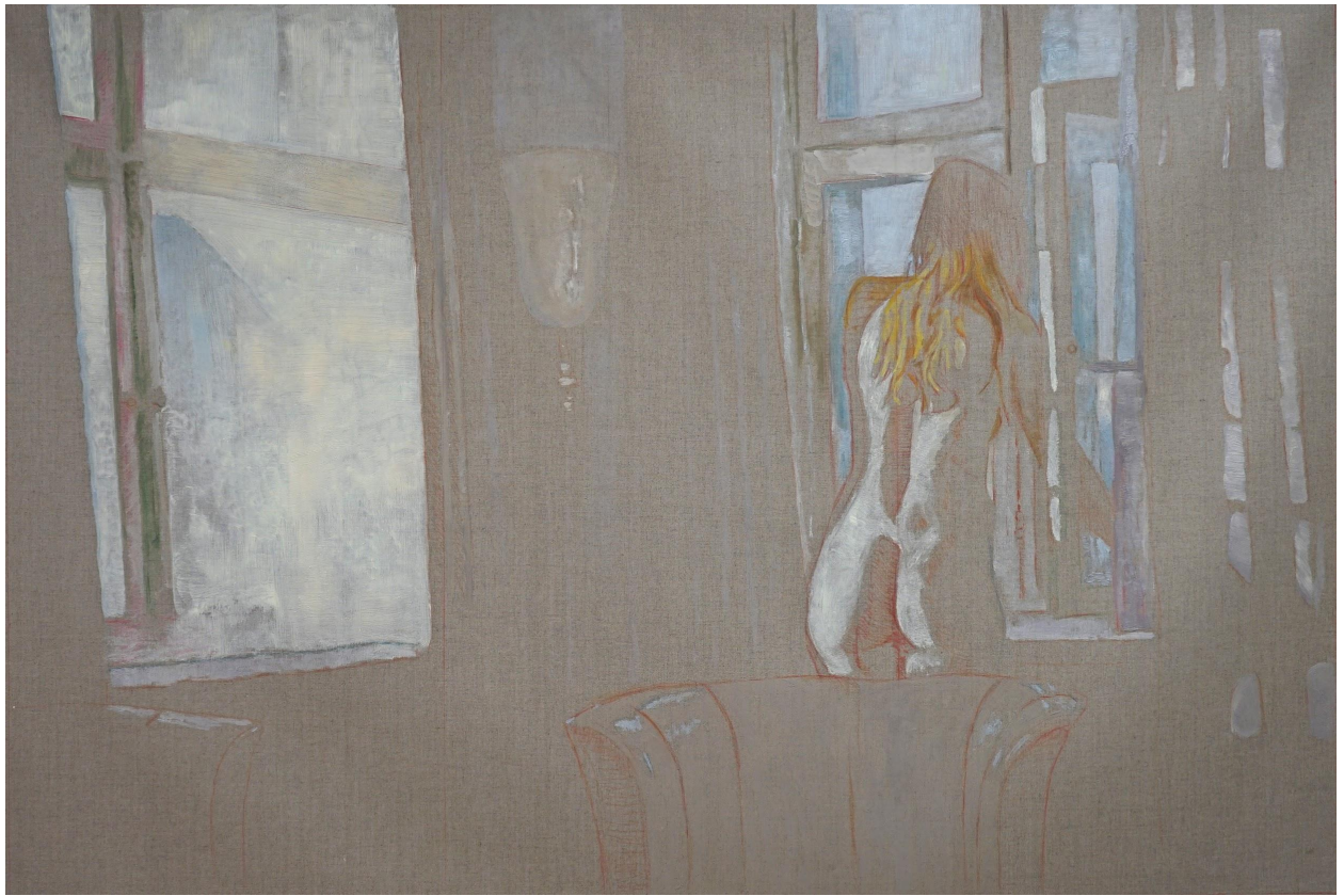
Hopper Window , 2021 | oil on linen, 120x180 cm