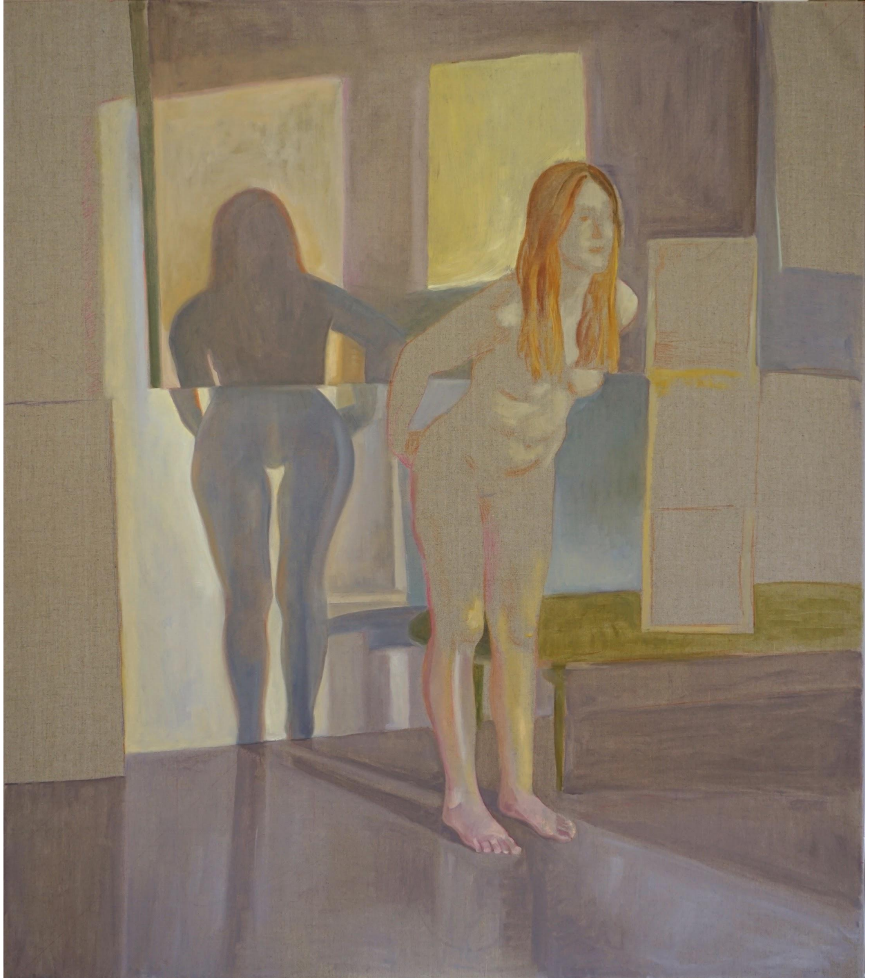
Allure by Shadow , 2021 | oil on linen, 160x140 cm