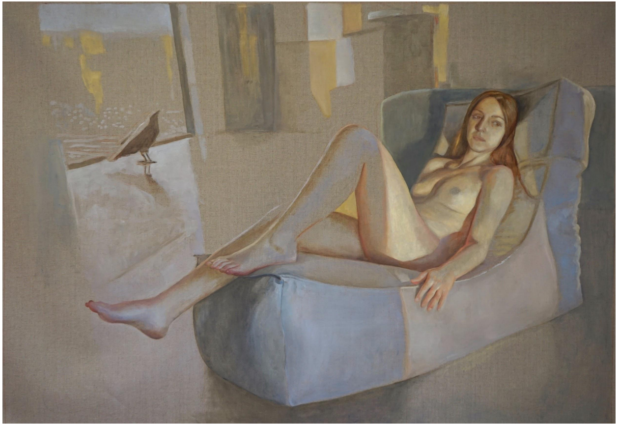
Days Pass , 2021 | oil on linen, 120x180 cm