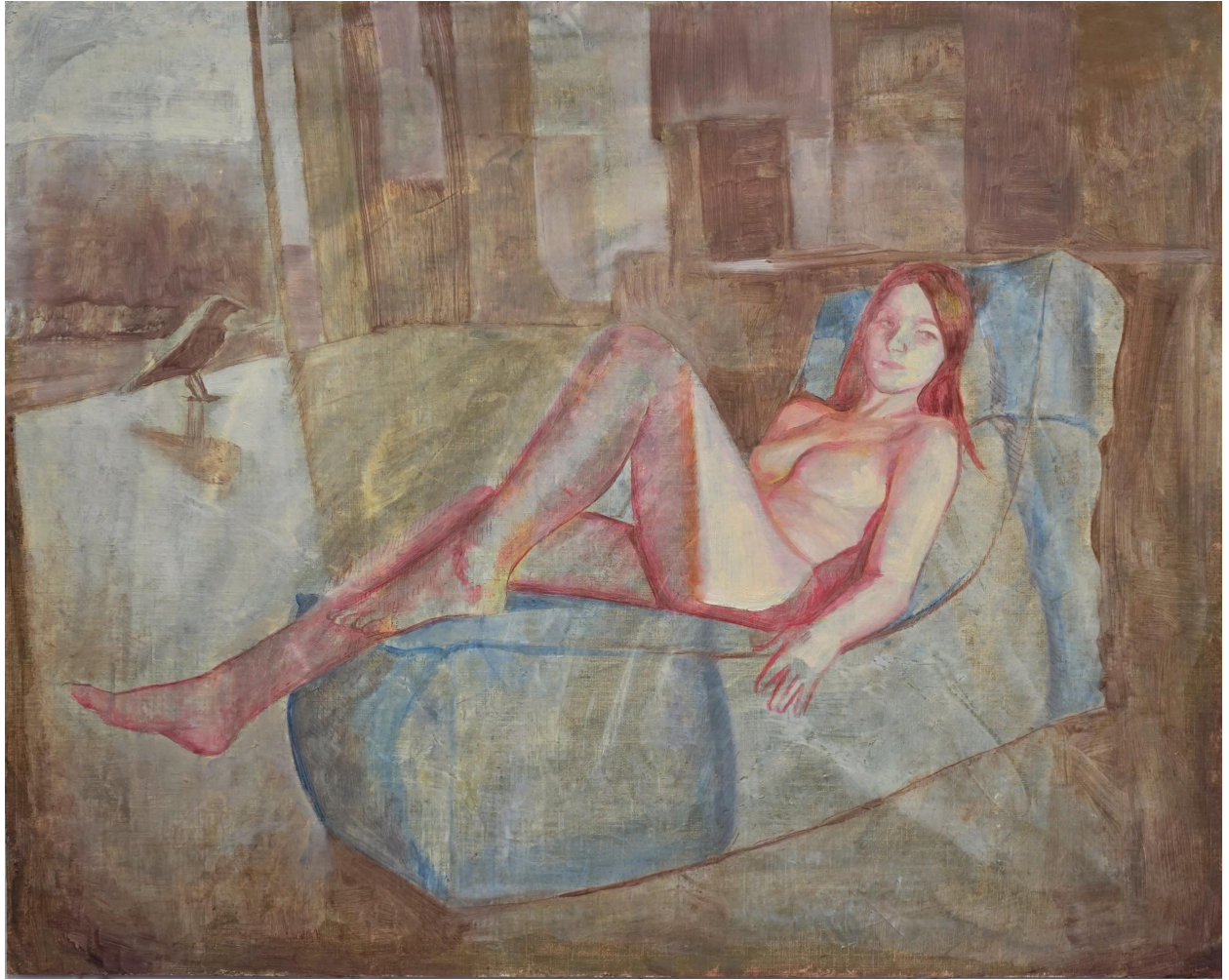
Cabin Lounge 2 , 2021 | oil on canvas paper, 41x51 cm