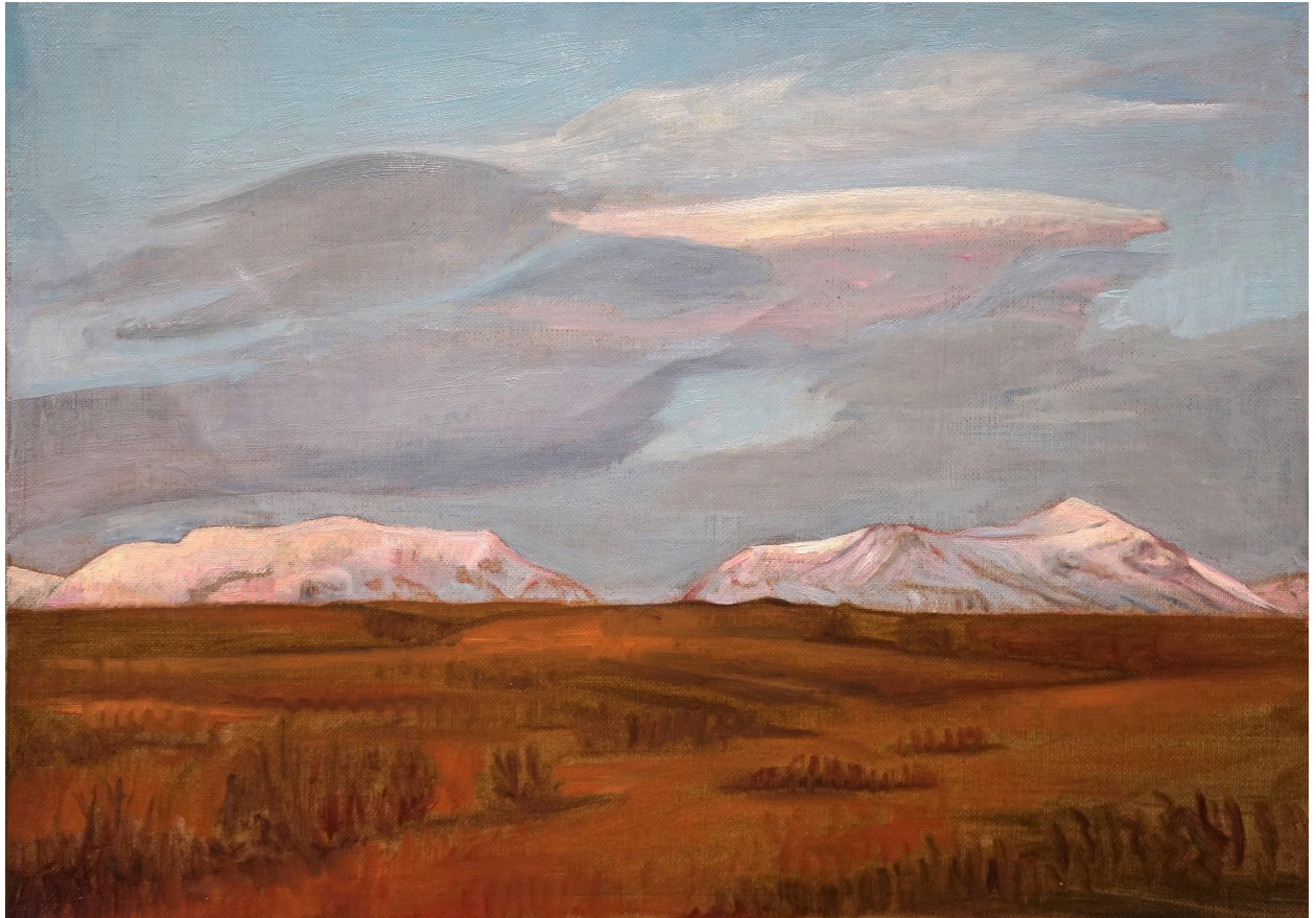
Rauðafell & Högnhöfði , 2021 | oil on linen, 20 x 36 cm