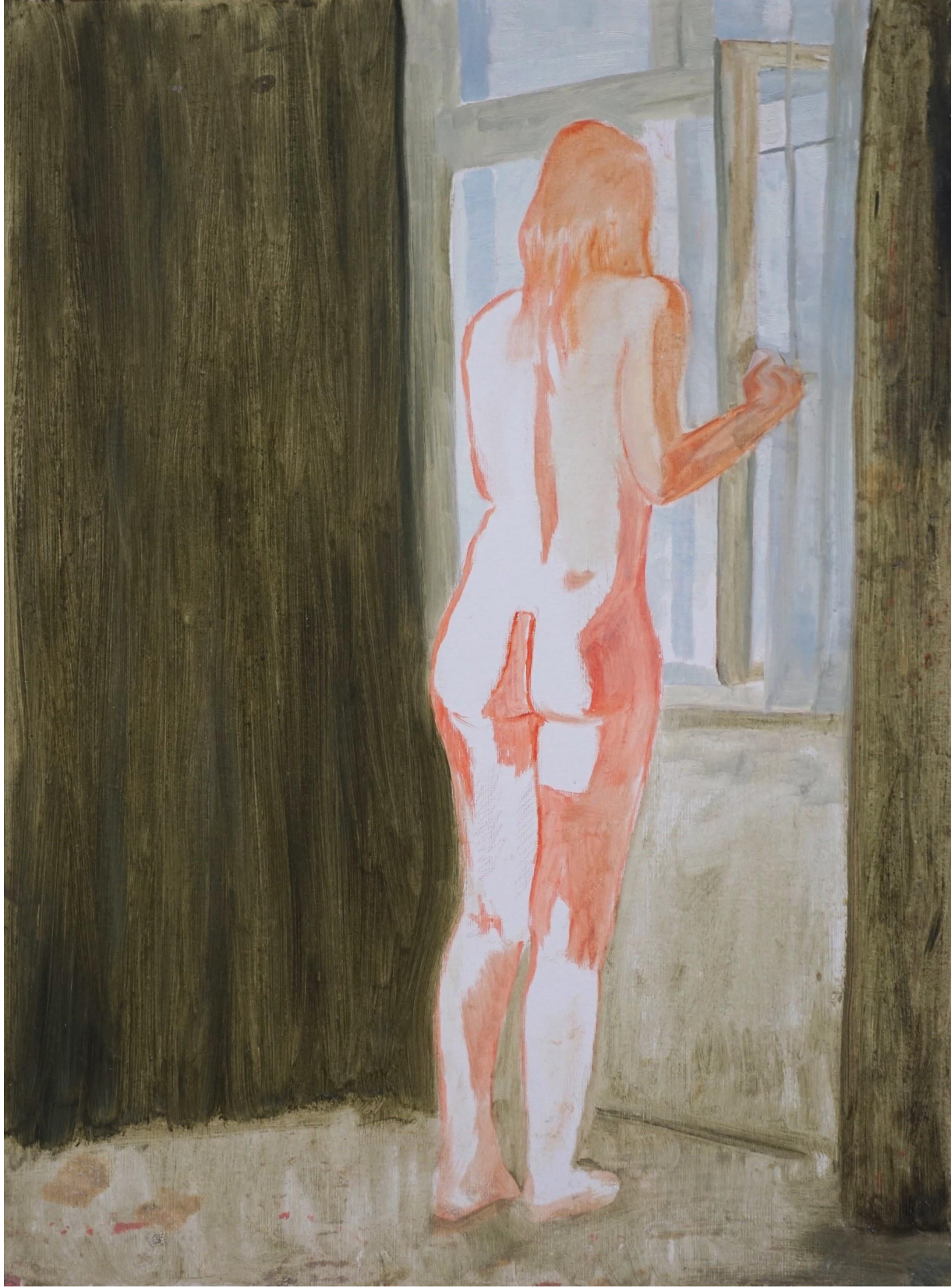
Borg Window 1 , 2021 | oil on canvas paper, 51x41 cm