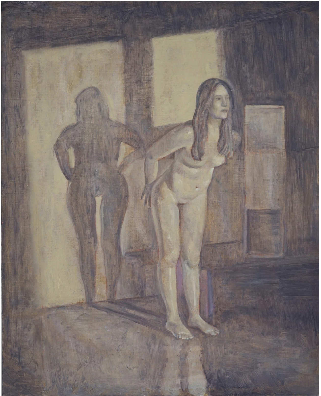
Shadow Work , 2021 | oil on canvas paper, 51x41 cm