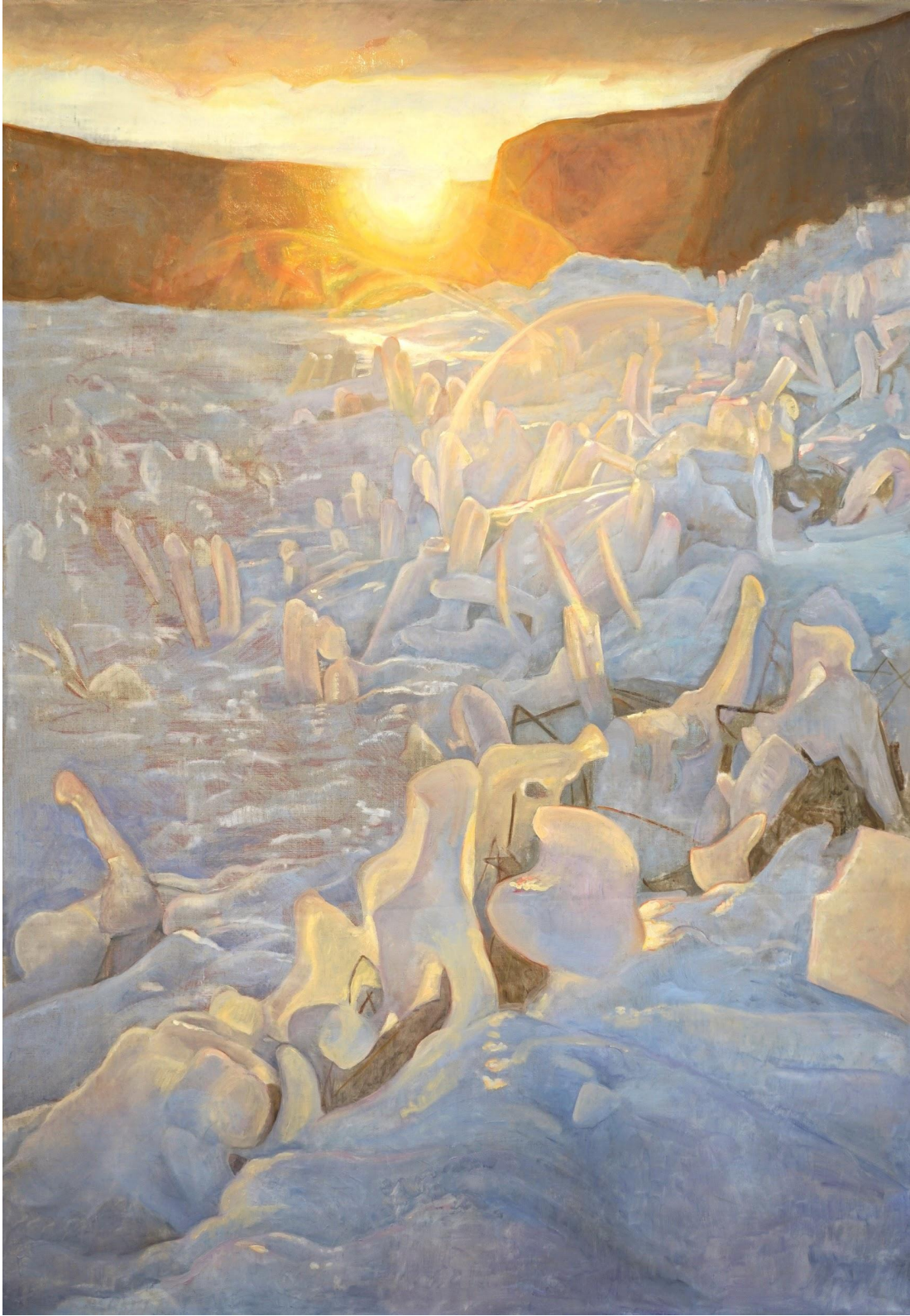
Prismatic Landscape , 2021 | oil on linen, 63x43 cm