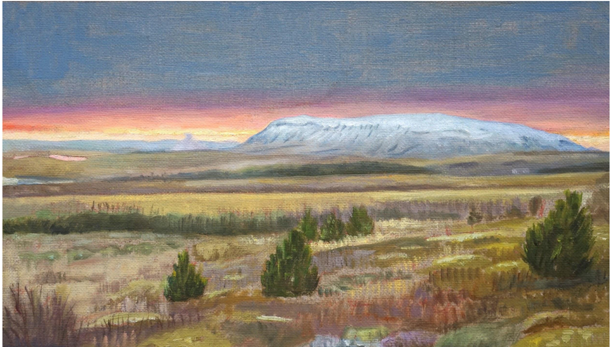
Vörðufell-Blue , 2021 | oil on linen, 20 x 36 cm