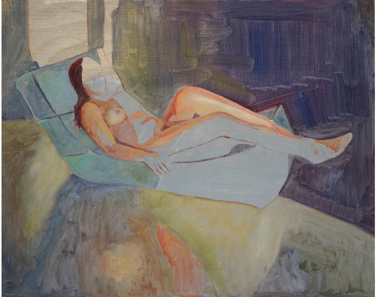
Cabin Lounge 1 , 2021 | oil on canvas paper, 41x51 cm